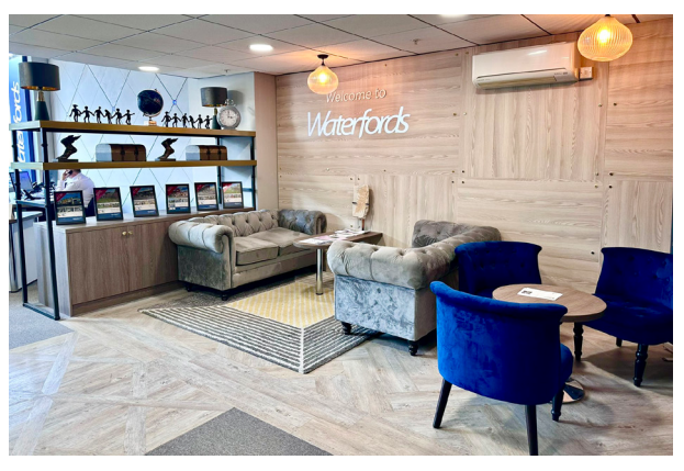
FLEET LETTINGS & PROPERTY MANAGEMENT